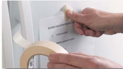
For attaching production records during assembly, warranty cards, or other temporary communications, 3M™ Masking Tapes 203, 2307, 200, and 2214 are cost-effective options.