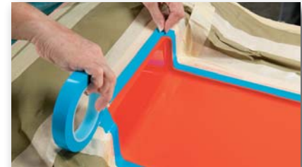
For composite masking, 3M fine line (see page 8) overtapes 3M crepe masking tape for gelcoat color separation.