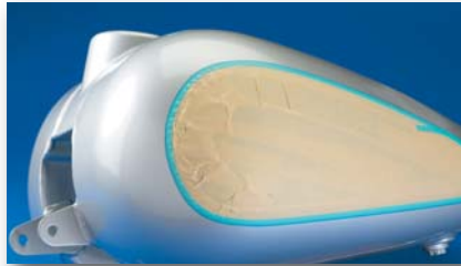
A combination of 3M™ Fine Line Masking Tape and 3M™ Crepe Masking Tape readies a motorcycle gas tank for custom painting that creates a sharp, high impact graphic image.