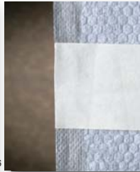
For splicing paper or fabric, 3M™ Flatback Tapes provide high machine direction tensile strength and easy cross tear. Rubber adhesive holds securely on materials ranging from kraft paper to nonwoven fabric.