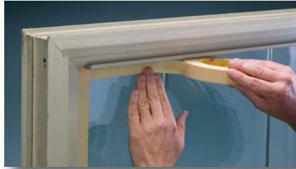
For best-in-class holding power for critical lines and clean removal, 3M™ Masking Tape 231 offers an optimum combination of characteristics for highly valued products or processes.