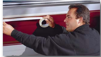
With a specialty processed film backing, 3M™ Fine Line Masking Tape 218 tapes over fresh paint sooner than crepe tapes with less chance of imprint damage.