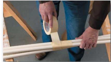
A quick easy wrap of 3M™ Masking Tape bundles plastic or metal pipes and other items. Select from wide range of temperature resistance to meet storage or transport conditions.